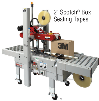
2" Scotch® Box Sealing Tapes