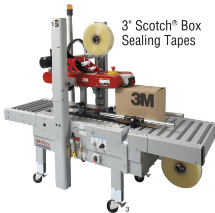
3" Scotch® Box Sealing Tapes