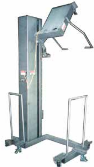
Optional Column Bowl Dumper