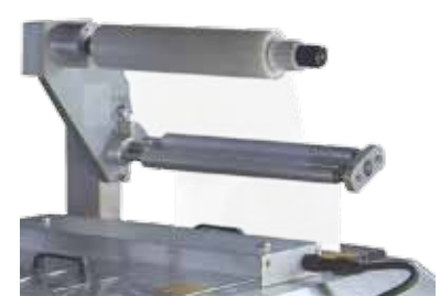
Cutting station Packages are separated Film trim is automatically removed