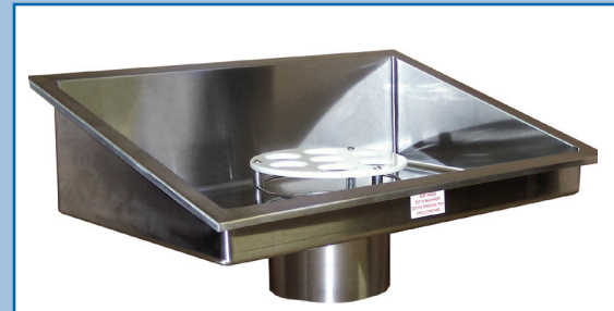
STAINLESS STEEL COVERED FEED TRAY