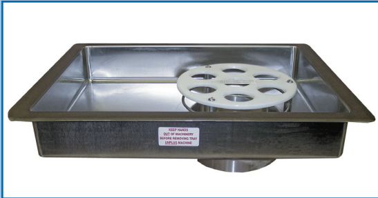
LOW PROFILE STAINLESS STEEL FEED TRAY