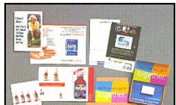
Samples produced by the 203P