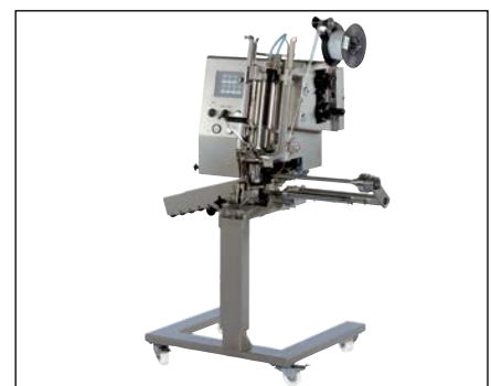
KDCM with electronic control