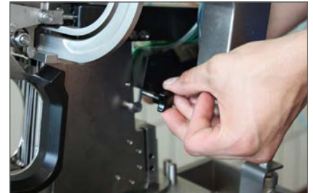
Service-friendly: knife replacement without tools