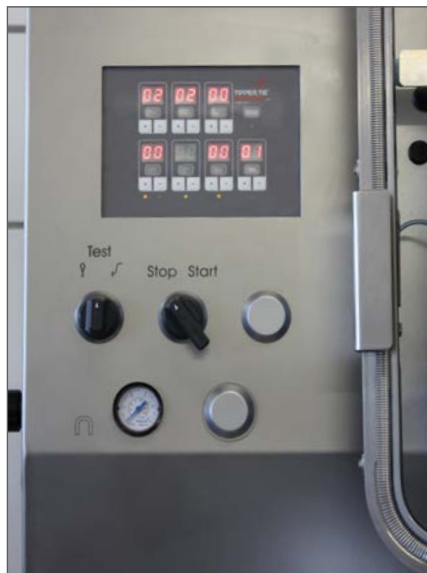
The KDCM is operated via a modern digital display.

The KDCM is operated via a digital display with 20 stored programs. This modern and easy-to-use system leaves nothing to be desired in terms of convenience, hygiene and efficiency. The user interface comprises the functions knife, loop and label counter.