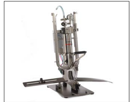
DCM with base plate