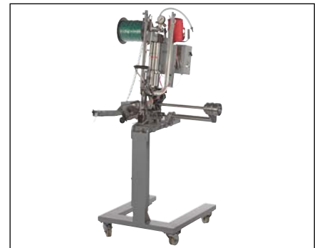
DCM with base trolley