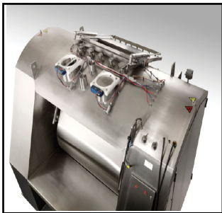
Canopy additions such as Ingredient door, liquid and/or dry ingredient inlets, canopy scraper