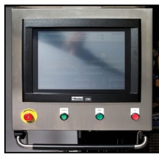
Rear Auxiliary Control Panel