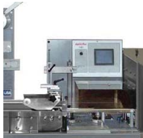
Simple layout of machine controls and adjustable former for quick changeover