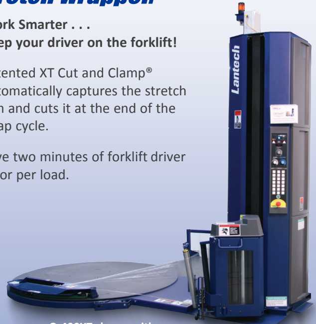
Q-400XT shown with C lick-n-go Remote Control

Save two minutes of forklift driver labor per load.