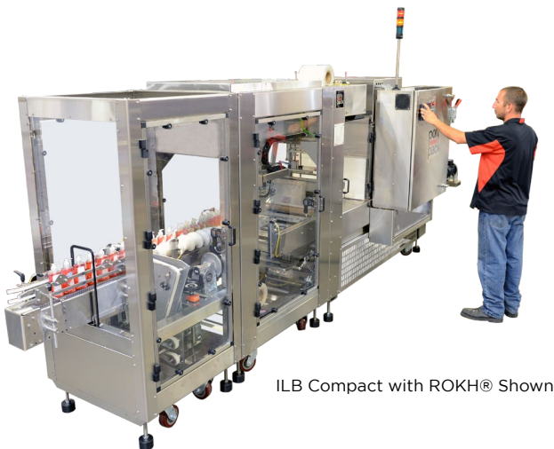
ILB Compact with ROKH® Shown

INLINE BUCKET SHRINK BUNDLER. Polypack's ILB series shrink bundlers are intermittent motion shrink bundlers that use a bucket conveyor to wrap a wide range of products. They are available in hand-loaded models, or with a fully automatic product collation modules designed specifically for your application. Any products that can fit onto the bucket can be wrapped in bullseye shrink. For unstable products such as ovals and tubes, Polypack offers a patented ROKH® pick & place gantry that automatically picks up the product and places it onto the bucket conveyor for wrapping. Combined with servo-driven technology, the ROKH® pick and place system can load products quickly and accurately, and the system can be fine-tuned to transfer products with unprecedented precision.