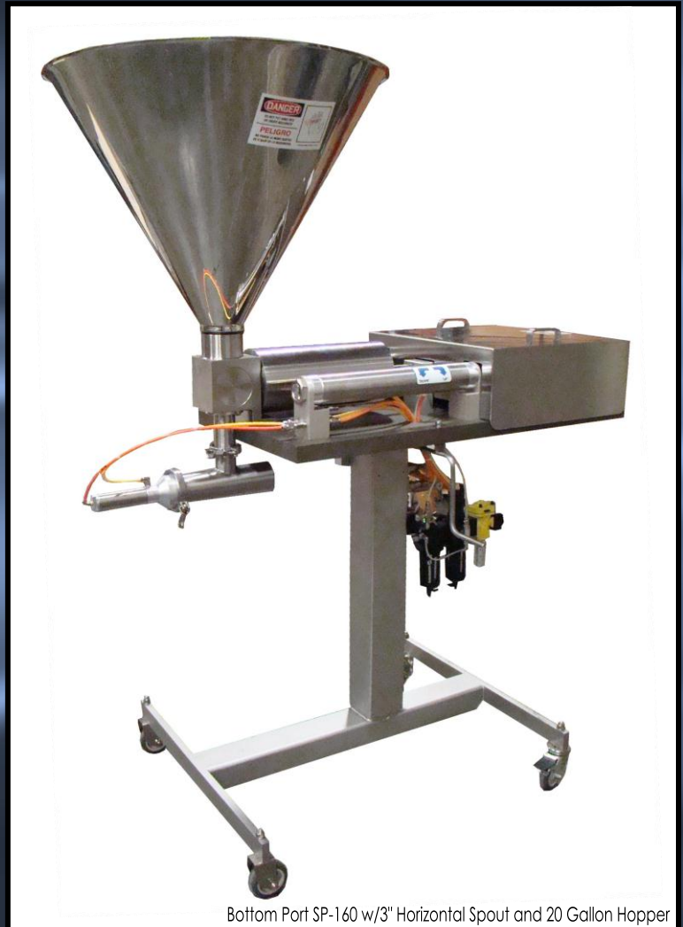
Bottom Port SP-160 w/3" Horizontal Spout and 20 Gallon Hopper

E-mail: info@hinds-bock | Web: HINDS-BOCK.COM