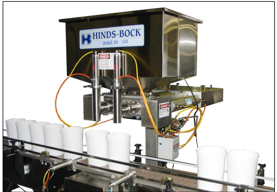
Front Port 2P-160 Tub Filling Line w/2" Vertical Blow-Off Spouts