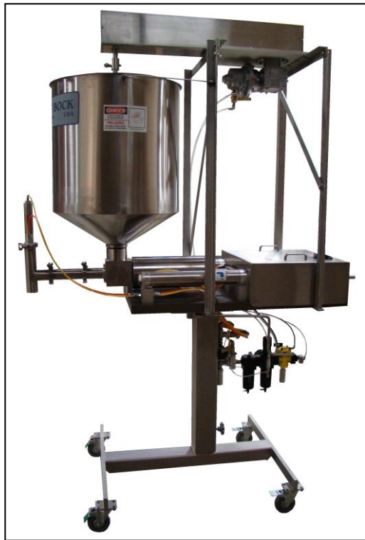
Front Port SP-160 w/2" Vertical Spout & Hopper Agitator