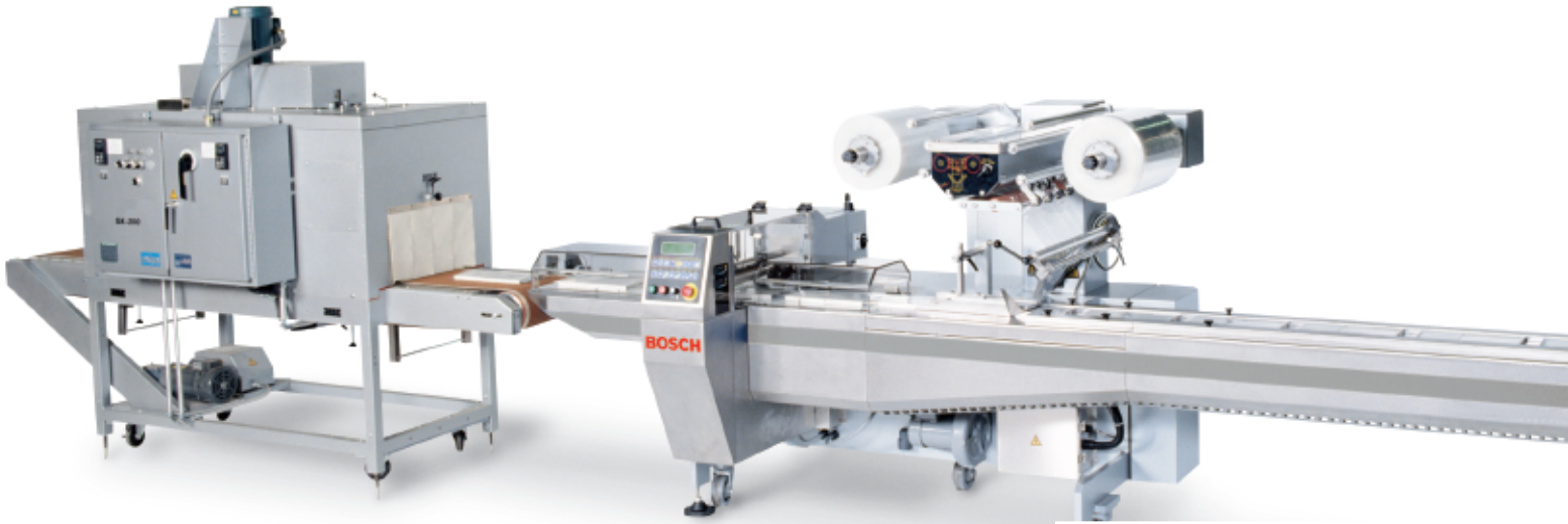
Optional Accessories and SK200 Shrink Tunnel Shown