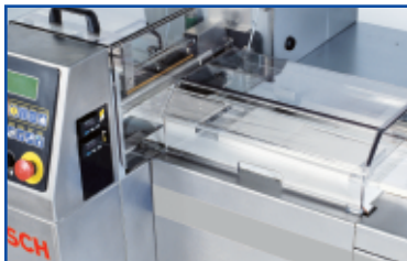
Linium 305 Rotary Cutting Head