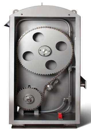
Chain Drive Side View