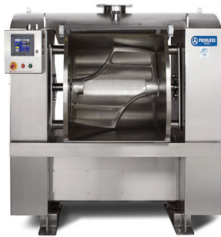
Hallmark - Front Bowl Open