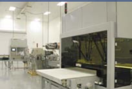
Delfi Feed Placer and Presto Top Loader

robot. “The flexibility of the Linium 301 wrapper and Delfi Feed Placer provides the type of automation we need,” stated Littman. Dobby’s Linium 301 wrapper is a rotary-head horizontal wrapper with the options of manual, semi-automatic or fully automatic feeding. The Linium 301’s servo-driven infeed conveyor interfaces with the Delfi Feed Placer for variable speed based on product flow and proper placement with incredible accuracy. The wrapped bars convey to a Dobby Model 7520 Carton Former forming two cartons at a time. The formed carton backlog is photo-eye monitored to ensure a precise carton flow necessary based on upstream demands. The current production line has the cartons traveling in one direction. As the product line grows, there is an option to form two cartons. These would then travel in opposite directions to service two separate lines.