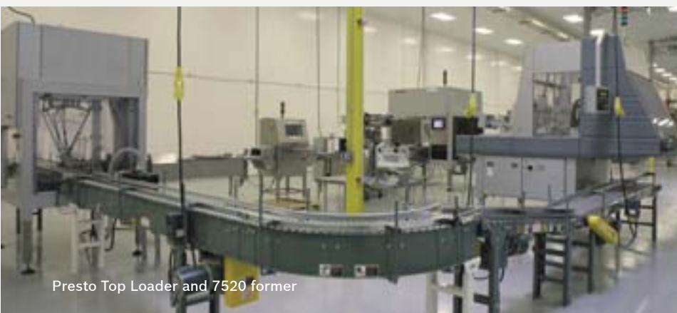
Presto Top Loader and 7520 former