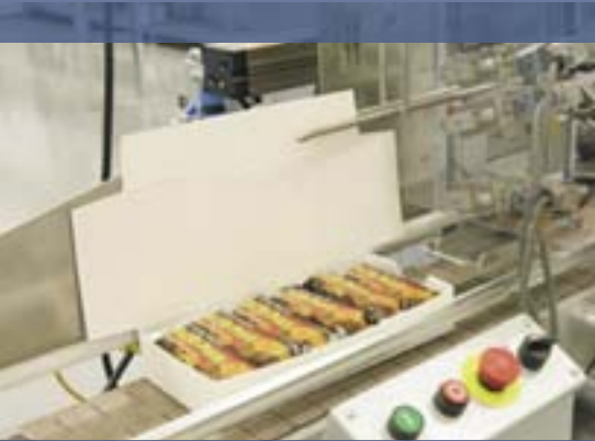
Carton in 840e closer