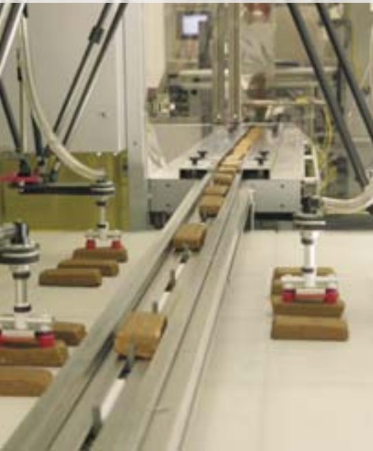
Delfi Feed Placer places bars into the wrapper