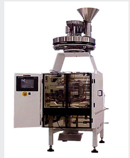
Ultima with Volumetric Filling System