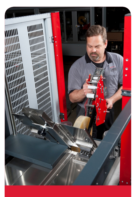
The CE-10's hinged case hold down plate allows for easy tape head removal. The case erector's open design without overhead cross members provides easy access for planned maintenance.

80 psi, approx. 2 cfm @ 10 cases per minute