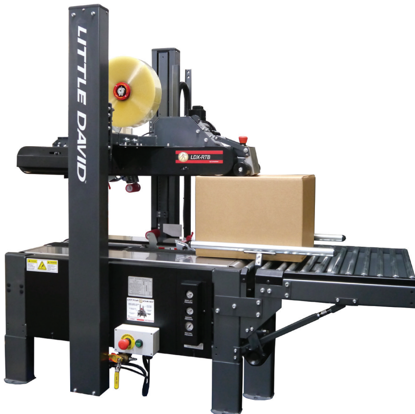
LDX-RTB shown with optional pack table

Automatically adjusting for height and width, cases are then top and bottom sealed.