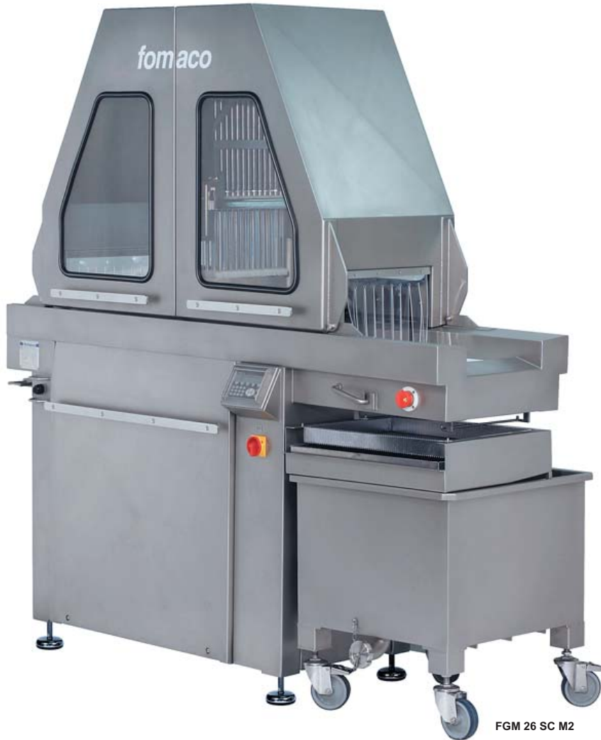
FGM 26 SC M2