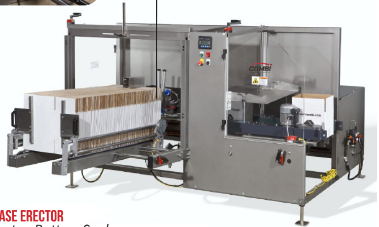
2-EZ® HS CASE ERECTOR Case Erector, Bottom Sealer