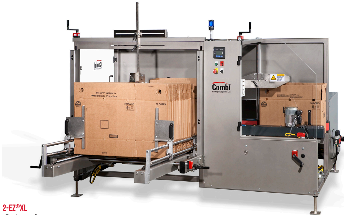
2-EZ ® XL For Large Cases

Combi Packaging System's heavy duty side belt drive case erectors form and bottom seal large and extra large cases at speeds up to 15 cases per minute. These machines are built for optimal durability, reliability and value. Engineered with the industry's strongest frame (lifetime warranty) for the most demanding 3-shift environments, the 2-EZ ® XL, 2-EZ ® XL HS, and 2-EZ ® XXL can readily integrate into your existing line. Combi's user-friendly EZ-load walk-in case magazines and quick changeover system are standard features. These dependable case erectors will provide years of service and can form and seal the widest variety of large cases, from single wall to triple wall corrugated.