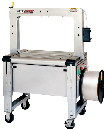
Models: LBX-2300 semiautomatic LBX-2330 automatic

The LBX-2300 Series stainless steel plastic strapping machines are designed for reliable packaging under harsh conditions. Built with stainless steel components, they are ideal for packaging applications where corrosion resistance is necessary in the meat, poultry and seafood industries. With a number of timesaving features and options, the LBX Series strapping machines simplify operation and maintenance.