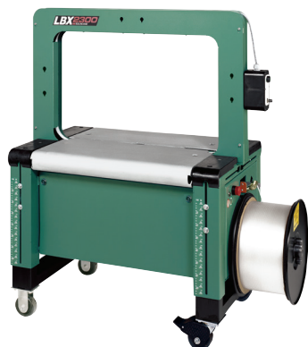
Models: LBX-2300 semiautomatic LBX-2330 automatic LBX2300/2330 large frame

The LBX-2300 Series plastic strapping machines provide reliable, high speed performance for heavy-duty applications, such as meat packaging, general distribution and the bundling of hardwood flooring. With a number of timesaving features, the LBX Series strapping machines simplify operation and maintenance. In addition to the standard LBX models, the LBX Series line includes specialized models for corrosion resistance in damp environments, oversized products and for small, irregular packages.