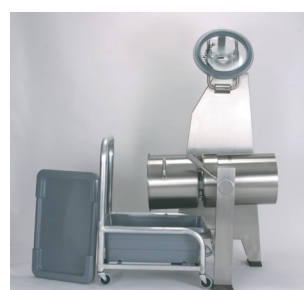
FOOD CART SHOWN WITH VCM